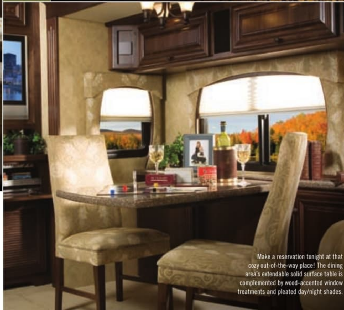
Make a reservation tonight at that cozy out-of-the-way place! The dining area's extendable solid surface table is complemented by wood-accented window treatments and pleated day/night shades.