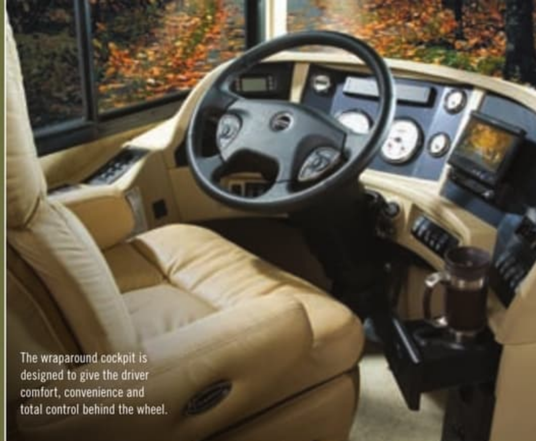
The wraparound cockpit is designed to give the driver comfort, convenience and total control behind the wheel.