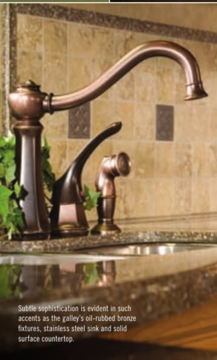
Subtle sophistication is evident in such accents as the galley's oil-rubbed bronze fixtures, stainless steel sink and solid surface countertop.