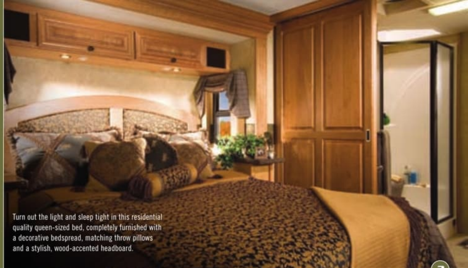
Turn out the light and sleep tight in this residential quality queen-sized bed, completely furnished with a decorative bedspread, matching throw pillows and a stylish, wood-accented headboard.