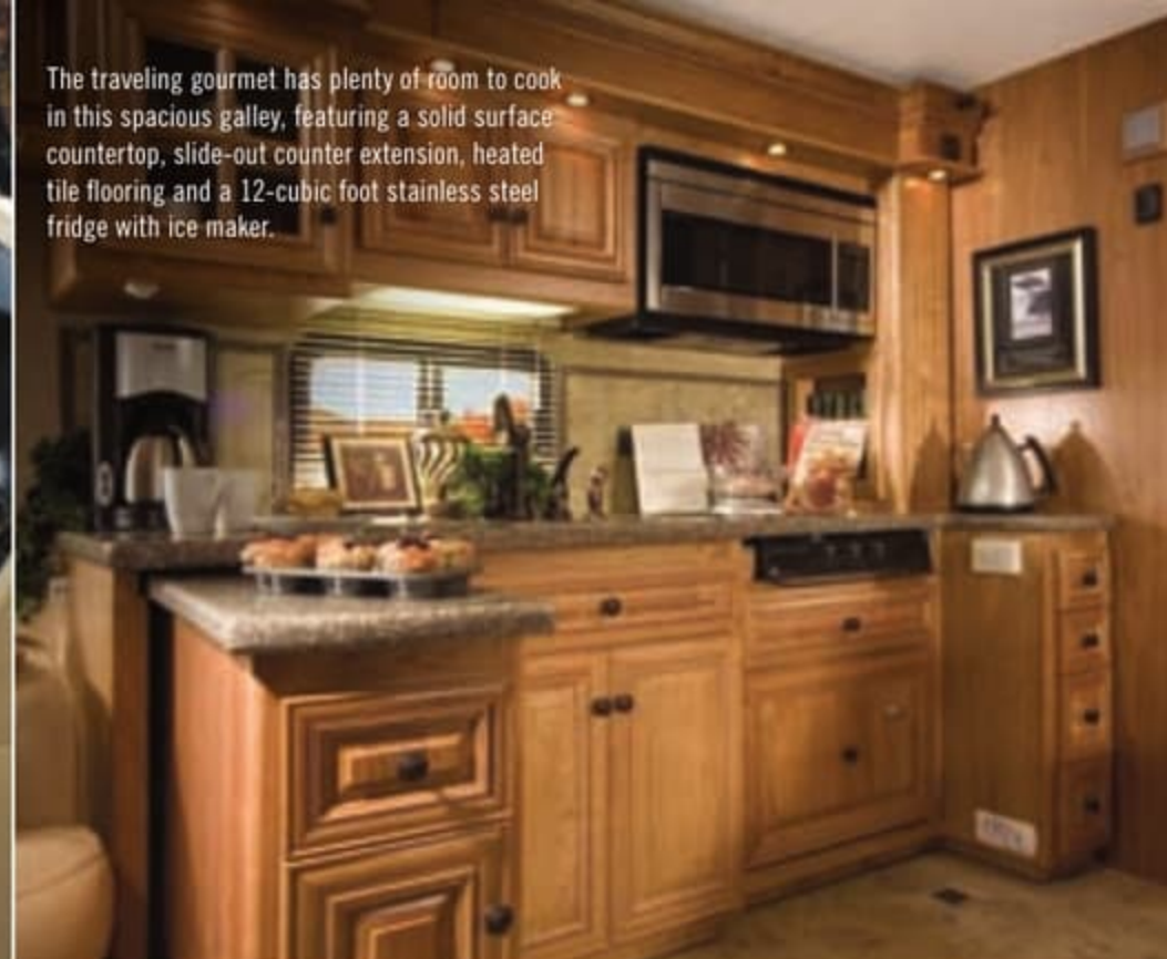
The traveling gourmet has plenty of room to cook in this spacious galley, featuring a solid surface countertop, slide-out counter extension, heated tile flooring and a 12-cubic foot stainless steel fridge with ice maker.