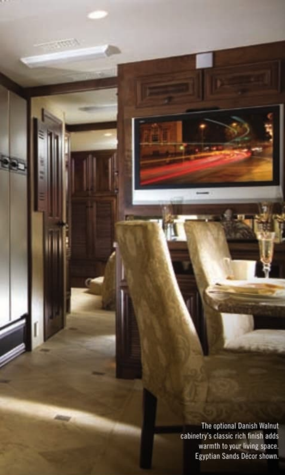
The optional Danish Walnut cabinetry's classic rich finish adds warmth to your living space. Egyptian Sands Décor shown.