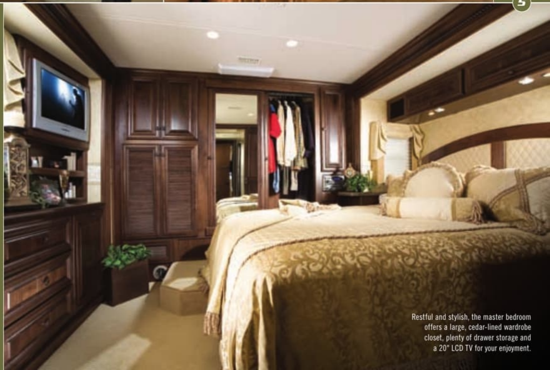
Restful and stylish, the master bedroom offers a large, cedar-lined wardrobe closet, plenty of drawer storage and a 20" LCD TV for your enjoyment.