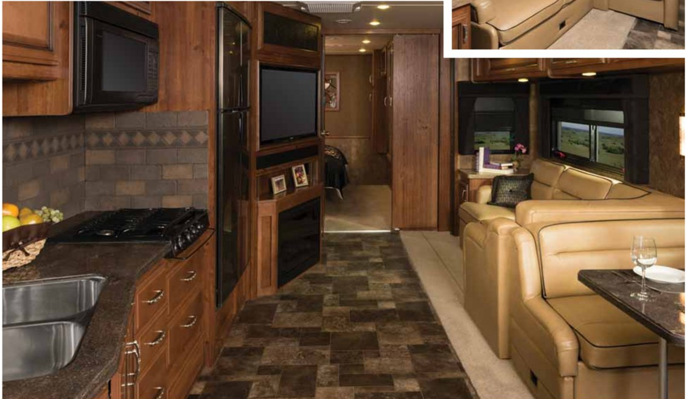
BOUNDER 33C shown in Sultry Obsidian interior décor with Spice wood cabinetry