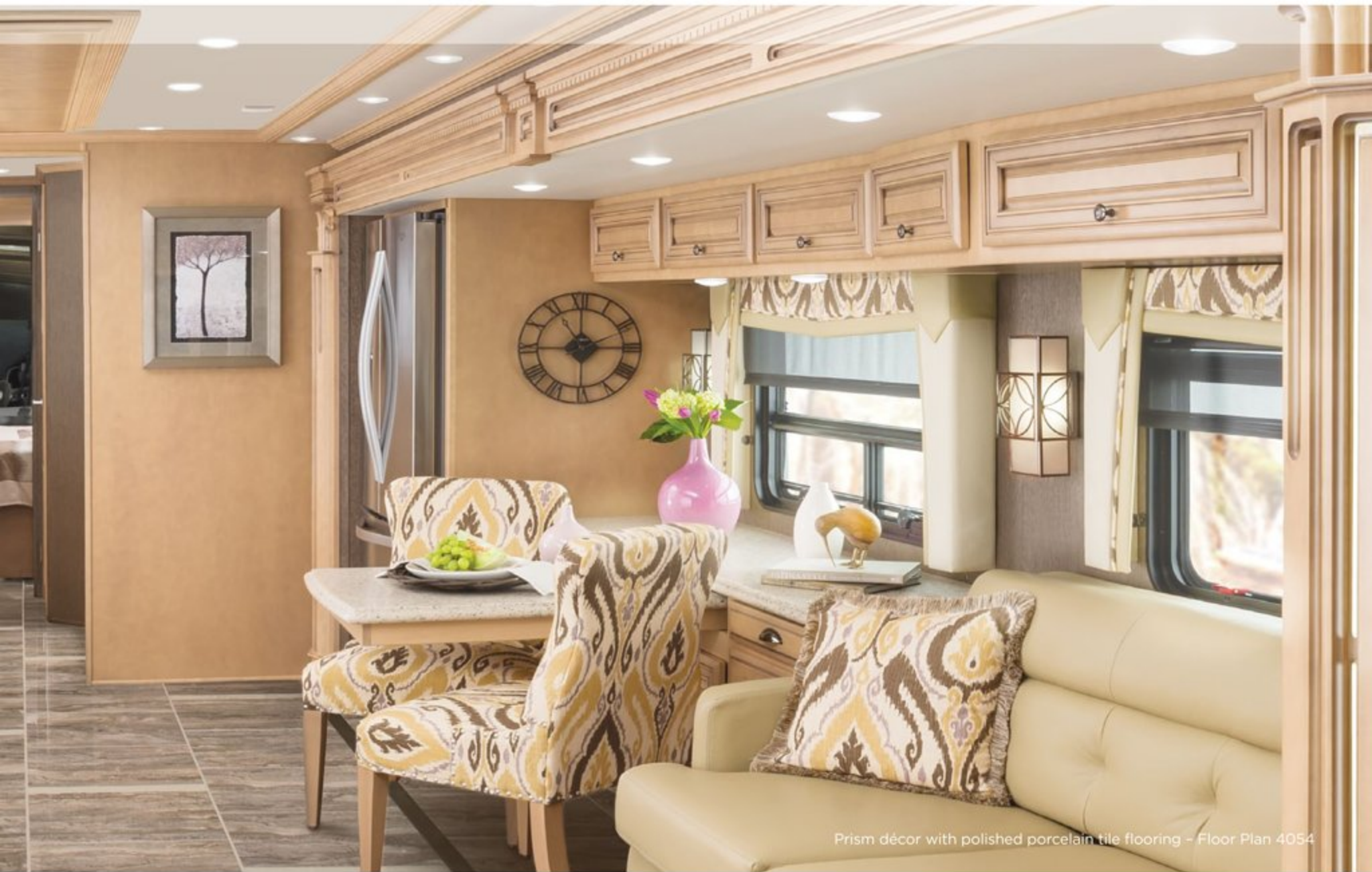
Prism décor with polished porcelain tile flooring - Floor Plan 4054