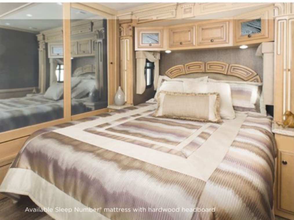
Available Sleep Number® mattress with hardwood headboard