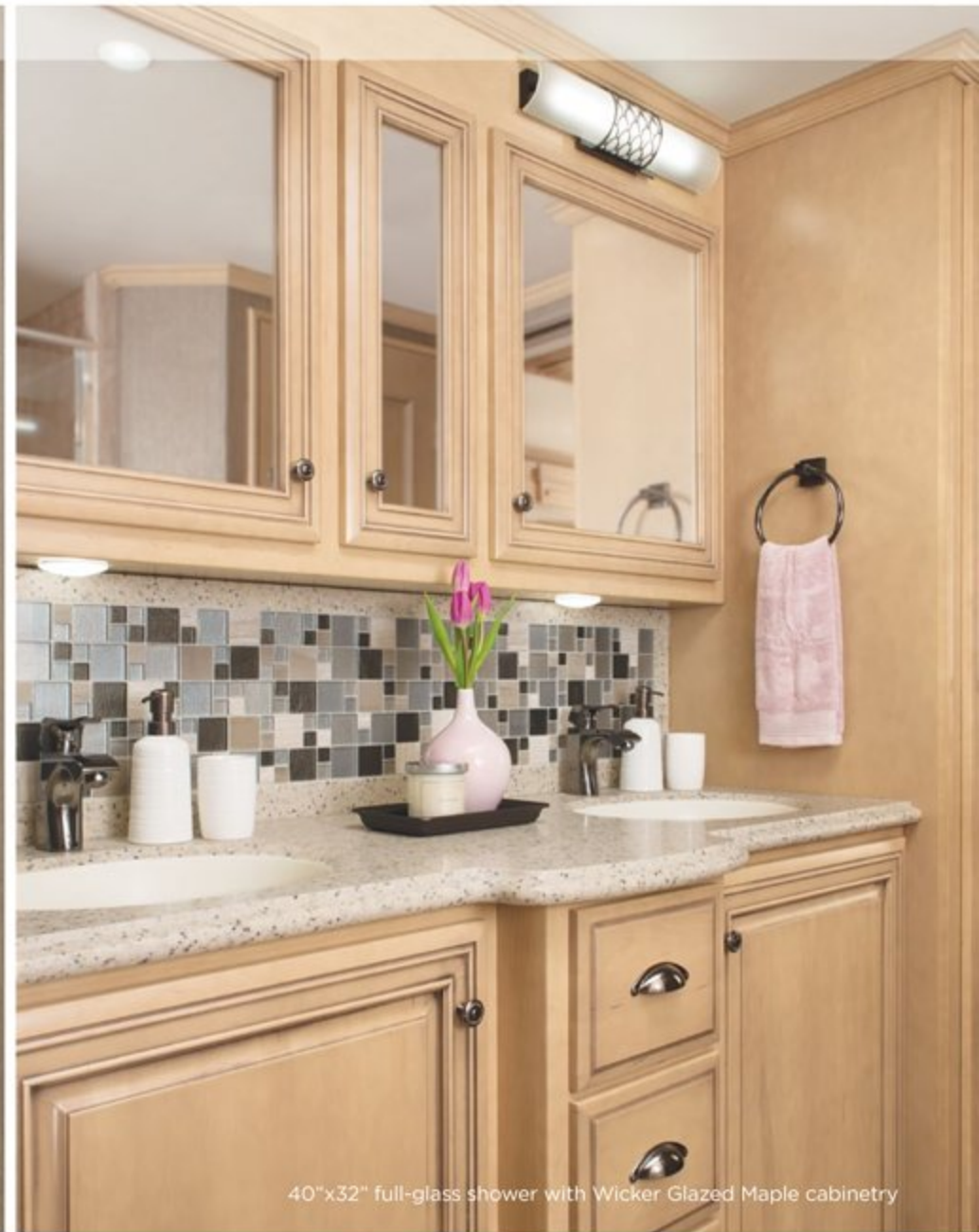
40"x32" full-glass shower with Wicker Glazed Maple cabinetry