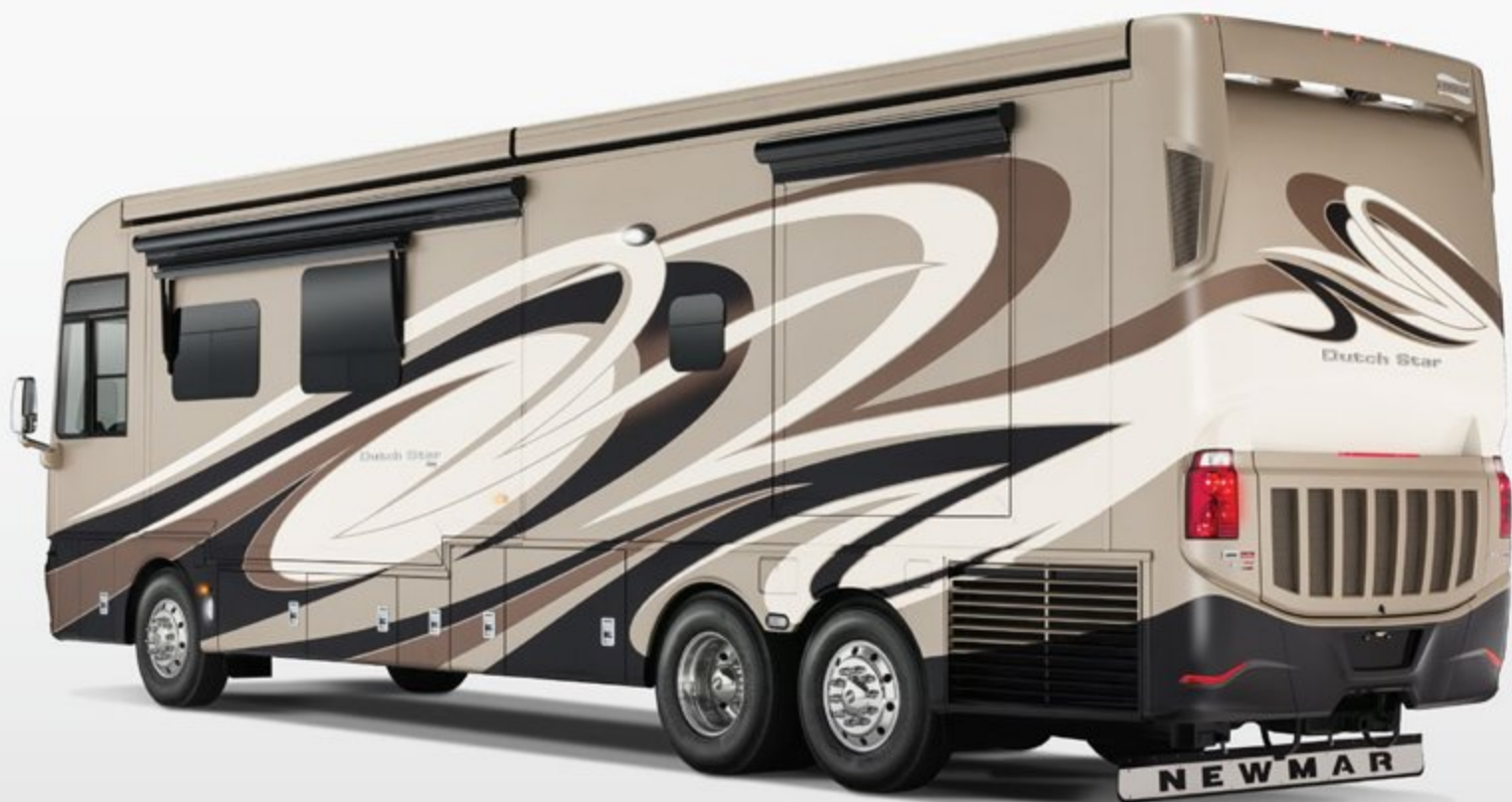
Full-paint Masterpiece™ Finish | Prism Exterior