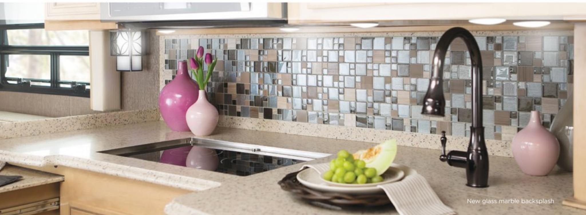
New glass marble backsplash

Experience the Newmar Difference. Explore each of the following sections for a complete look at the 2017 Dutch Star diesel motor coach.