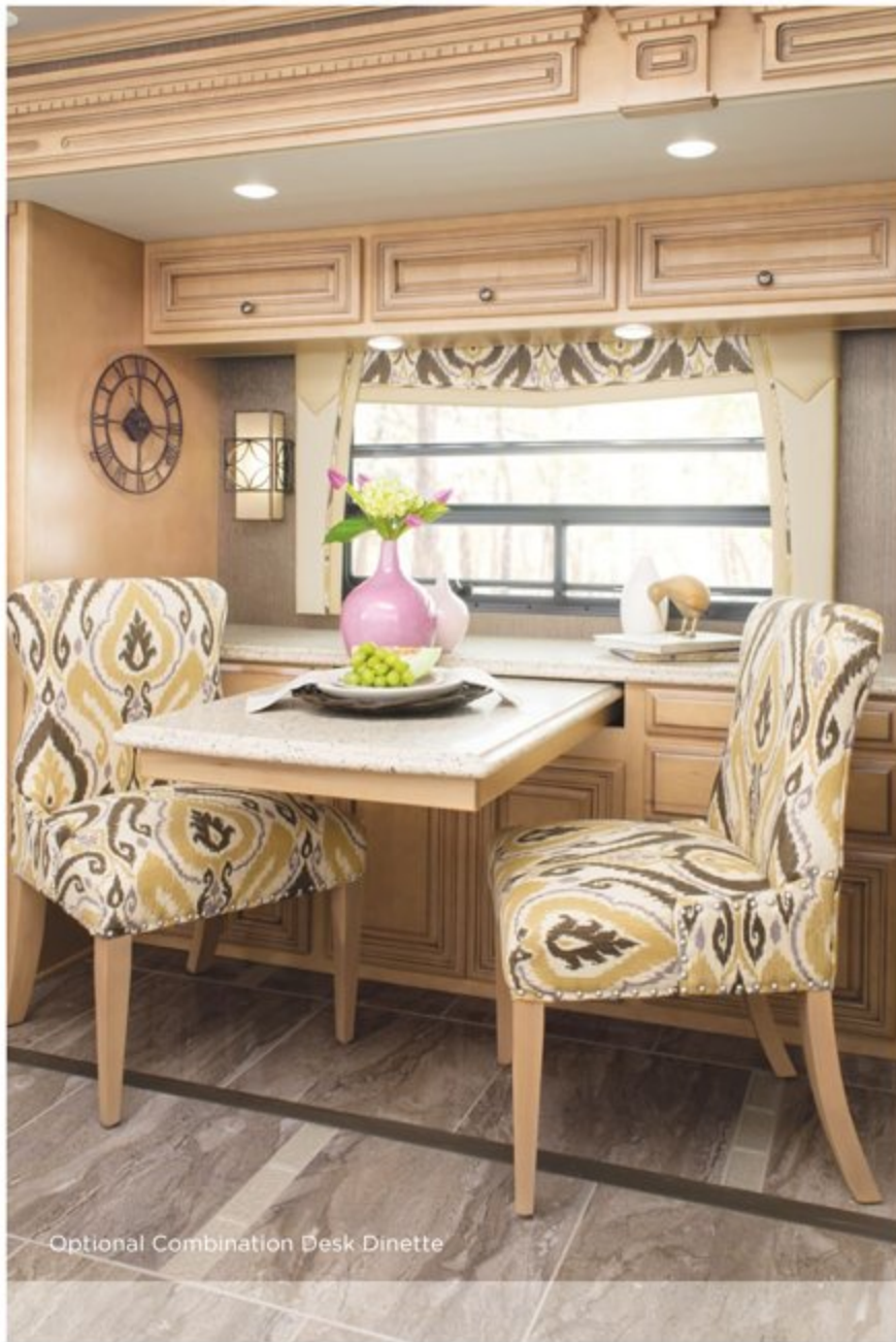
Optional Combination Desk Dinette