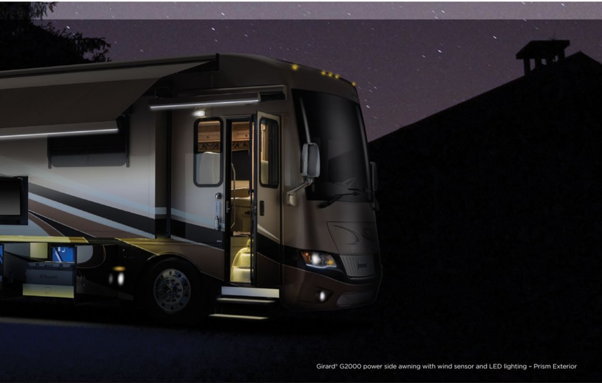
Girard® G2000 power side awning with wind sensor and LED lighting - Prism Exterior