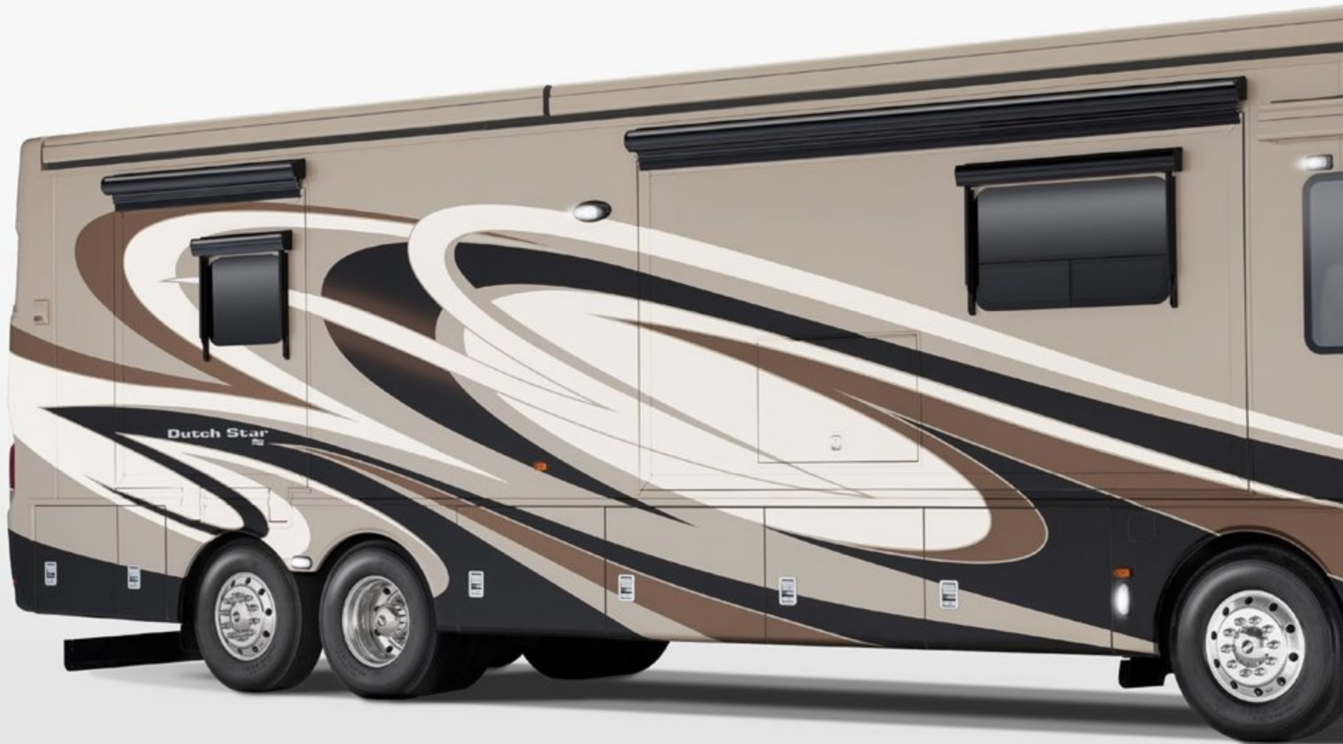
Cut & buffed full-paint Masterpiece™ Finish | Prism Exterior - Floor Plan 4054