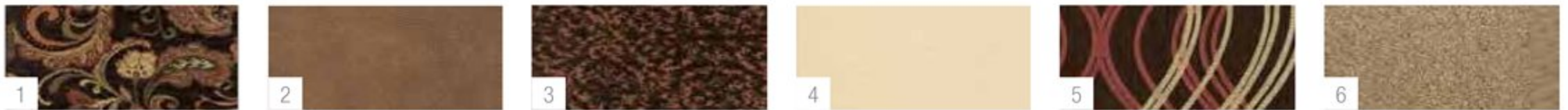
1. Main 2. Ultraleather Seating 3. Coordinate 4. Bedspread 5. Bedroom Accent 6. Carpet