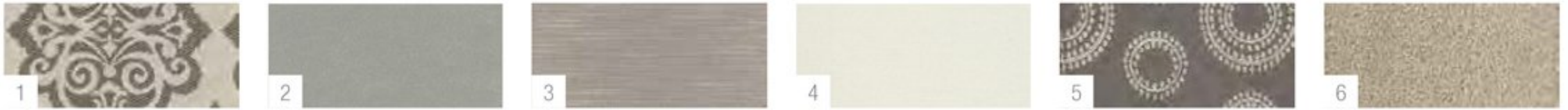
1. Main 2. Ultraleather Seating 3. Coordinate 4. Bedspread 5. Bedroom Accent 6. Carpet