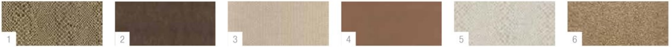
1. Main 2. Ultraleather Seating 3. Coordinate 4. Bedspread 5. Bedroom Accent 6. Carpet