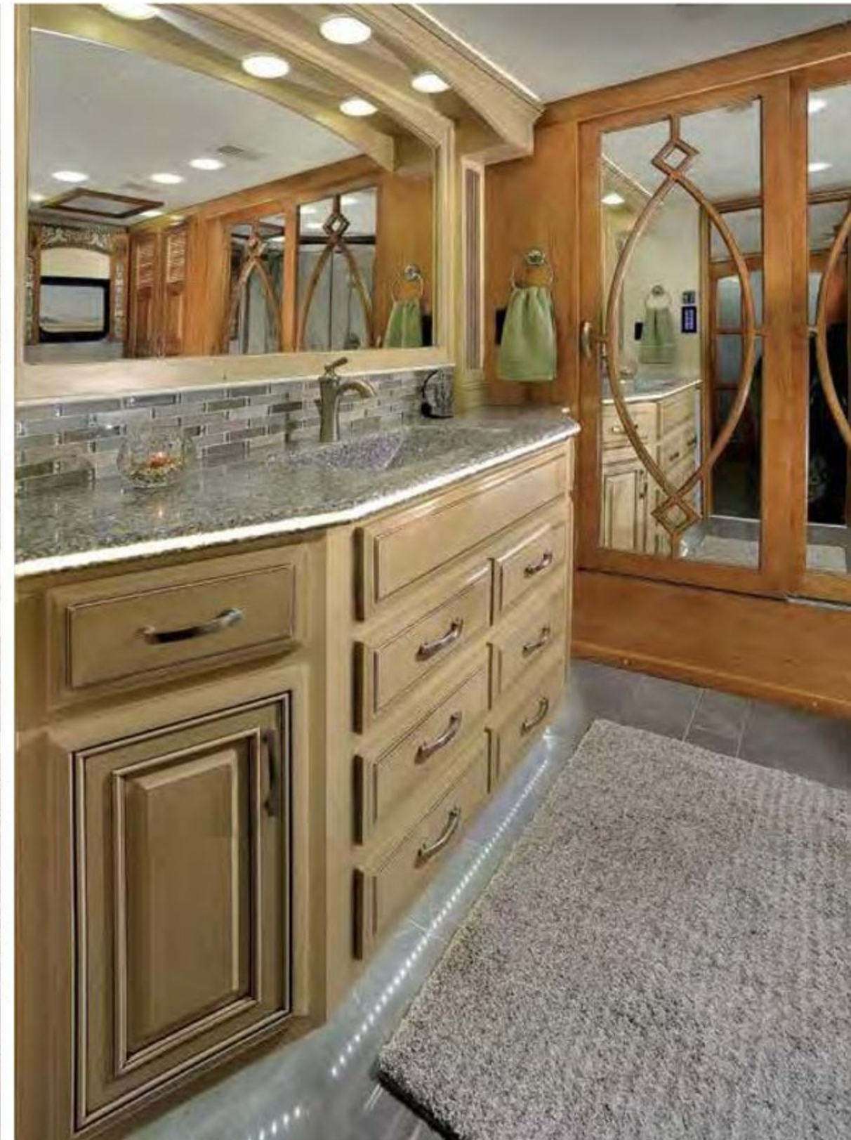
FEATURES: Spacious bedroom with ceiling fan | Bathroom featuring solid-surface countertops with LED accent lights and an integrated sink