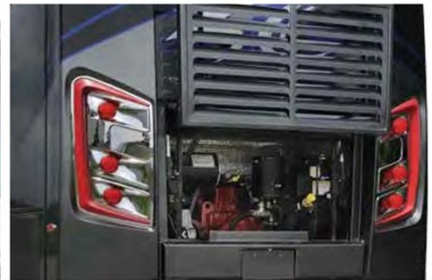
FEATURES: Girard® Vision dual-pitched patio awning with LED lights | Power rear engine door