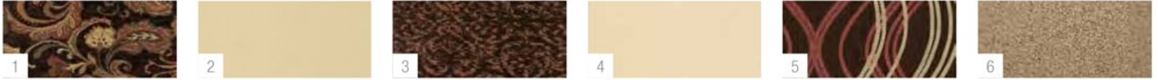
1. Main 2. Ultraleather Seating 3. Coordinate 4. Bedspread 5. Bedroom Accent 6. Carpet