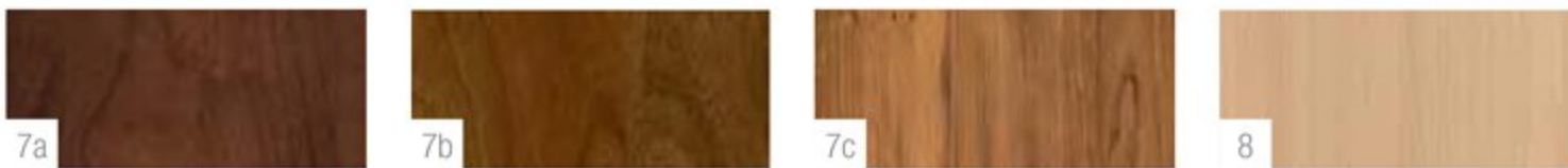
7. Main (a) Windsor Glazed Cherry | (b) Tuscan Glazed Cherry | (c) Natural Glazed Cherry 8. Wood (bath) Caramel Glazed Maple (excludes 42RBQ)