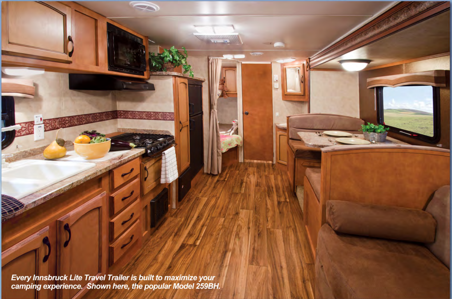
Every Innsbruck Lite Travel Trailer is built to maximize your camping experience. Shown here, the popular Model 259BH.

Make the most of your priceless free time in an Innsbruck Lite