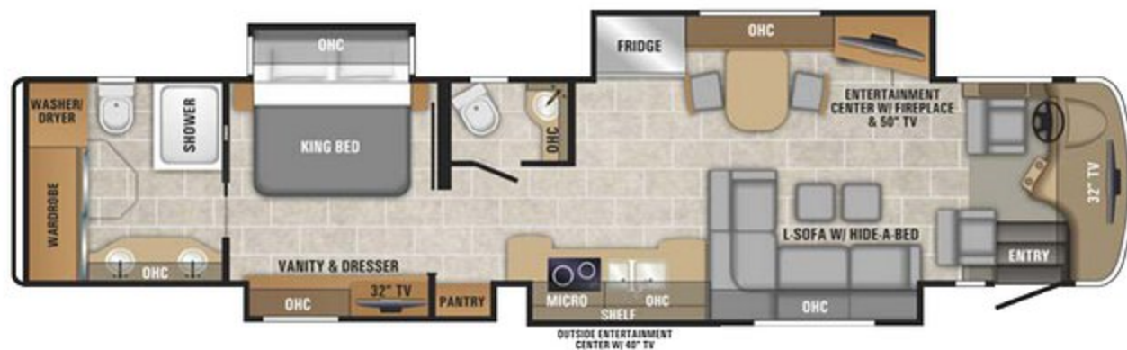
45B | OPTIONS: B AND D