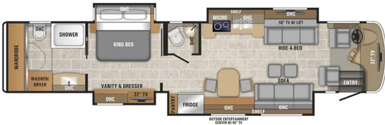
45A | OPTIONS: B AND C