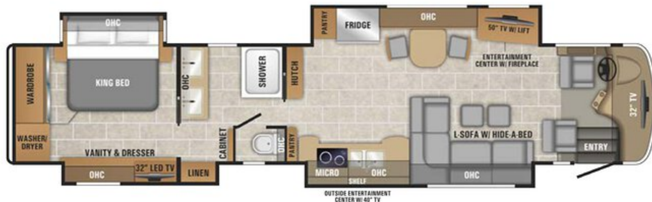
45Y | OPTIONS: B AND D