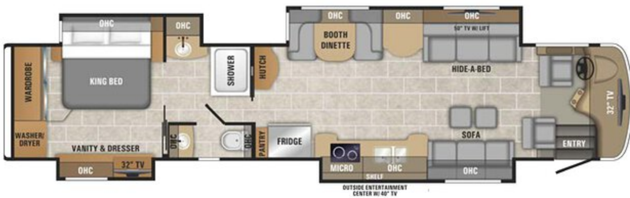
45X | OPTIONS: A AND C