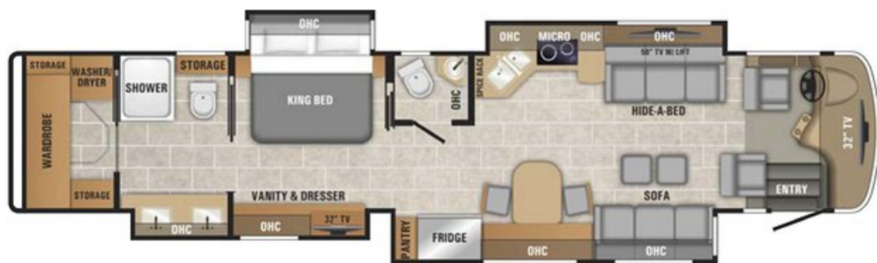
45F | OPTIONS: C