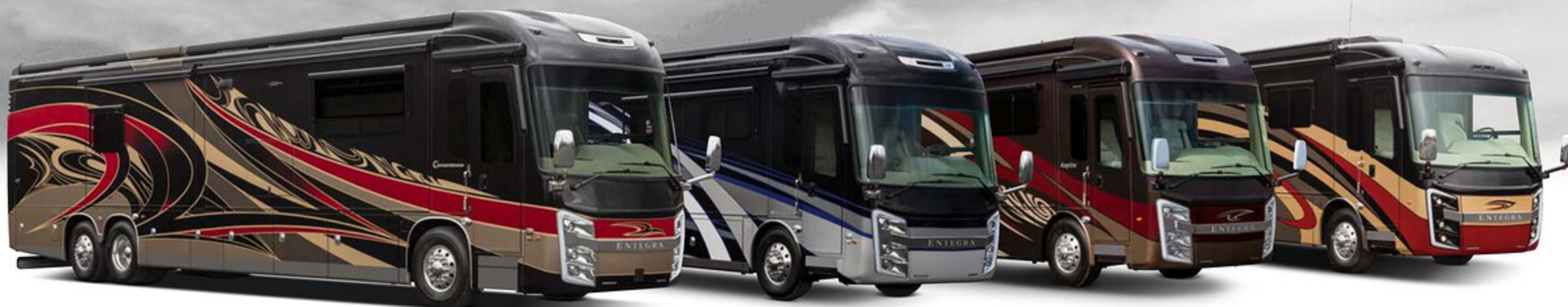
CORNERSTONE PG 3-6