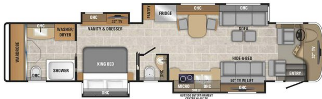
45W | OPTIONS: B AND C