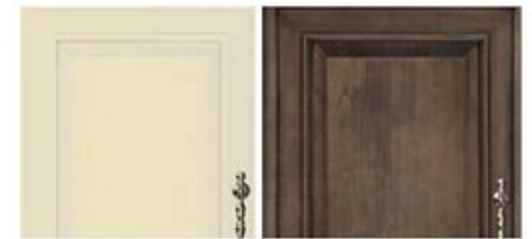
Serenity (Bathroom wood only) Stonewall Grey (Cashmere décor only)