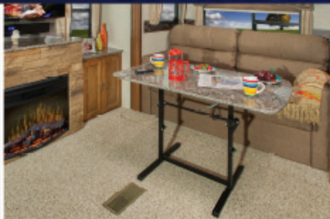
EXTRA COUNTER TOP SPACE CARD TABLE / PICNIC TABLE