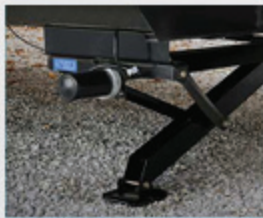
POWER STABILIZER JACKS (SSR ONLY)