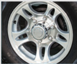
ALUMINUM WHEELS (SSR ONLY)