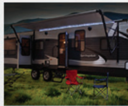
POWER AWNING W/ LED LIGHTS