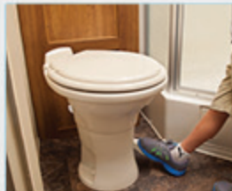
PORCELAIN FOOT FLUSH TOILET