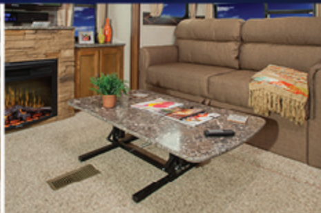
COFFEE TABLE / OTTOMAN