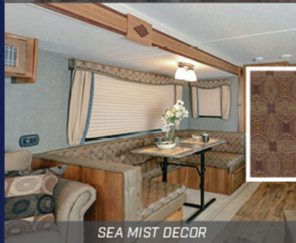
SEA MIST DECOR