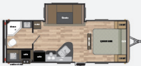
225RBWE WEIGHT: 5210 LENGTH: 28' 10"