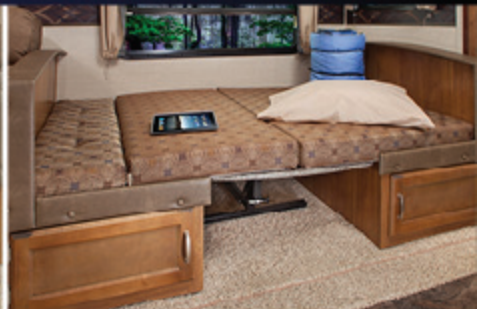
SLEEPING SPACE FOR TWO ADULTS