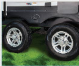
WIDE STANCE AXLES (Slide Out Models)