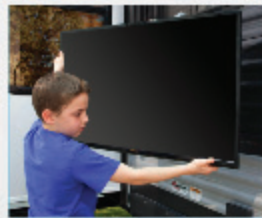
OUTDOOR TV BRACKET