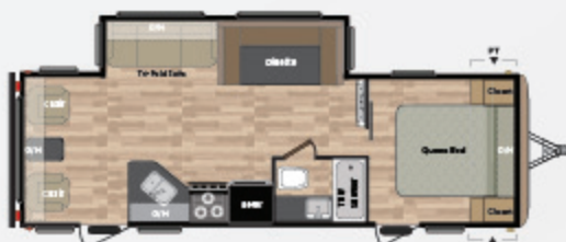
266RLWE WEIGHT: 6213 LENGTH: 28' 11"