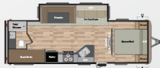
267BHEW WEIGHT: 6132 LENGTH: 28' 11"