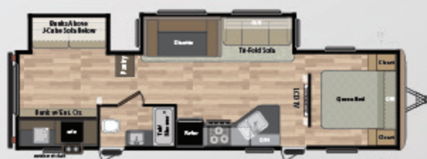
303BHEW WEIGHT: 7797 LENGTH: 34' 11"