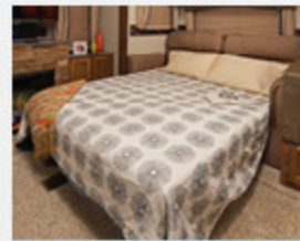
TRI-FOLD SLEEPER SOFA (SSR)