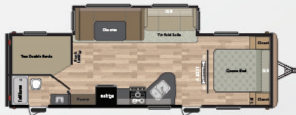
282BHEW WEIGHT: 6791 LENGTH: 32' 1"