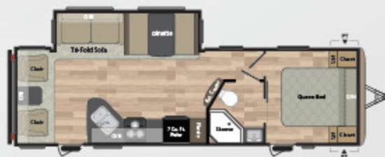
271RLWE WEIGHT: TBD LENGTH: TBD