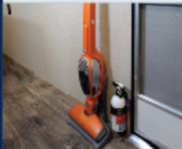
DUAL FUNCTION CORDLESS VACUUM