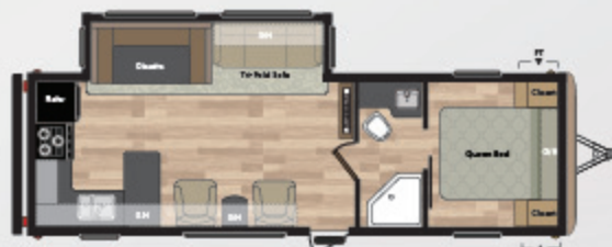
293RKWE WEIGHT: 6774 LENGTH: 32' 11"