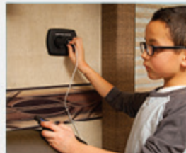
DIGITAL CHARGING STATION