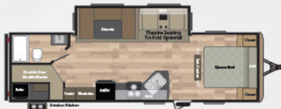
270BHEW WEIGHT: 6960 LENGTH: 32' 6"