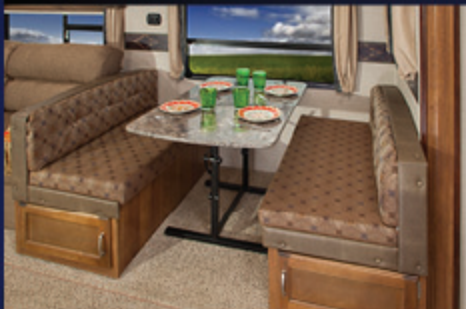
STANDARD IN ALL SPRINGDALES