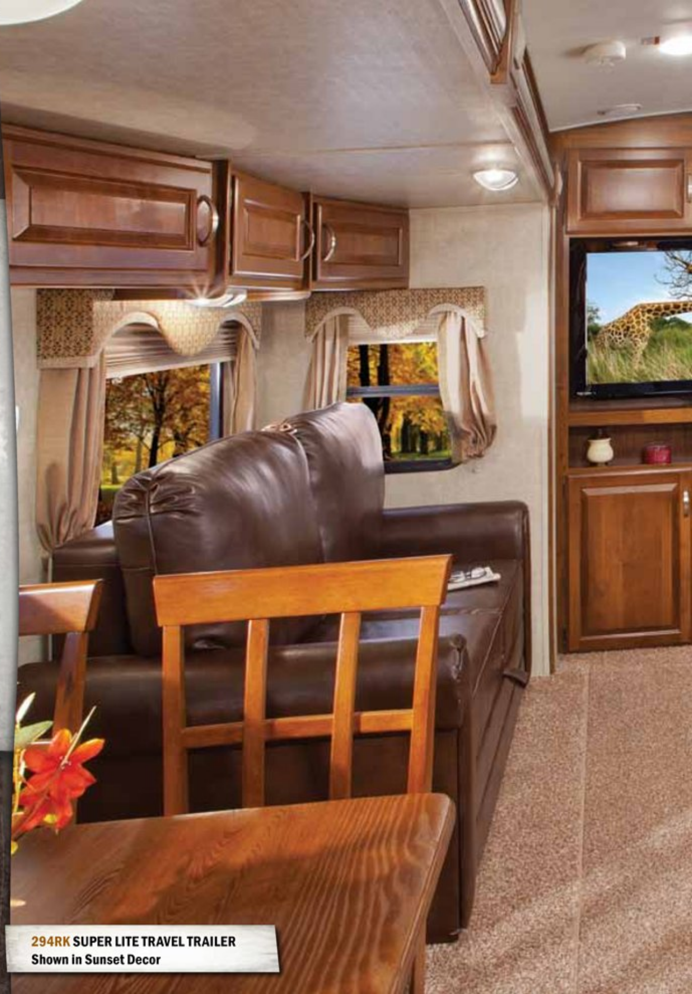
294RK SUPER LITE TRAVEL TRAILER Shown in Sunset Decor

MORE BEST IN CLASS FEATURES THAN THE COMPETITION